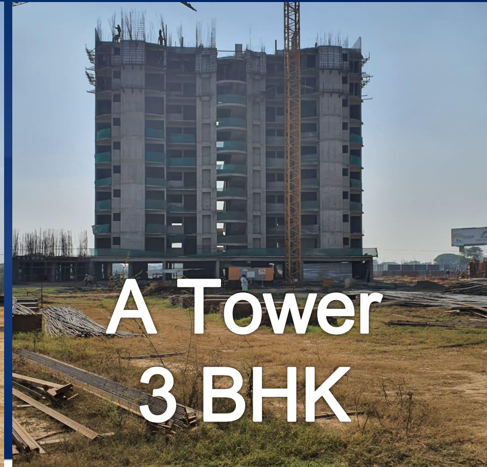
A Tower 3 BHK