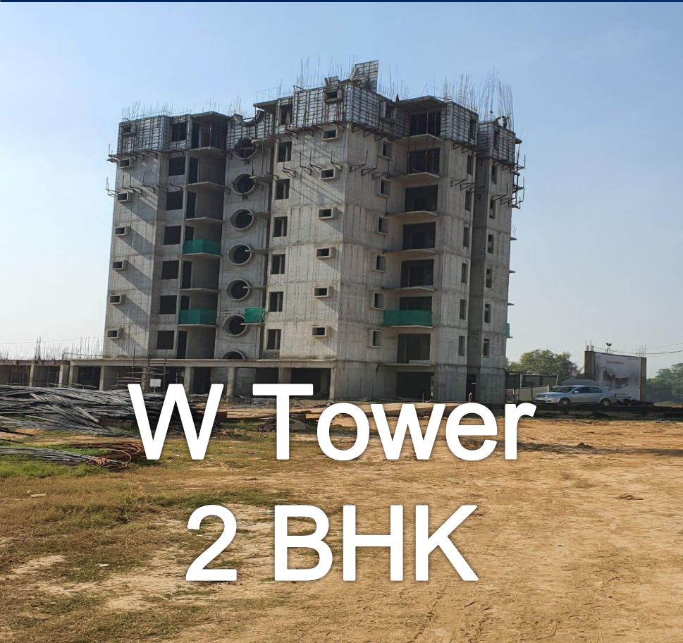
W Tower 2 BHK