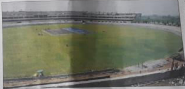
Work in progress at new PCA International Stadium at Mullanpur near Chandigarh on Friday. Kamaldeep Singh

The stadium work has been going on within the targeted time-frame and if things go as planned, Punjab Cricket Association may host one of the matches of the yet to be announced Indian series to be held in October-November 2016. The first phase of the stadium will be fully complete by January 2020 and we will also host Ranji Trophy matches at the stadium next season. The basic infrastructure of the stands is almost complete with the South Stand and North Stand top floors almost in shape. The players' dressing rooms are on the first floor and the players will come to the ground by the stairs. Besides, the dressing rooms will have saunas and gym facilities. Regular checkings are being done by the technical committee of Punjab Engineering College," said PCA Secretary R P Singh. The 38.2-acre stadium, where construction work began in