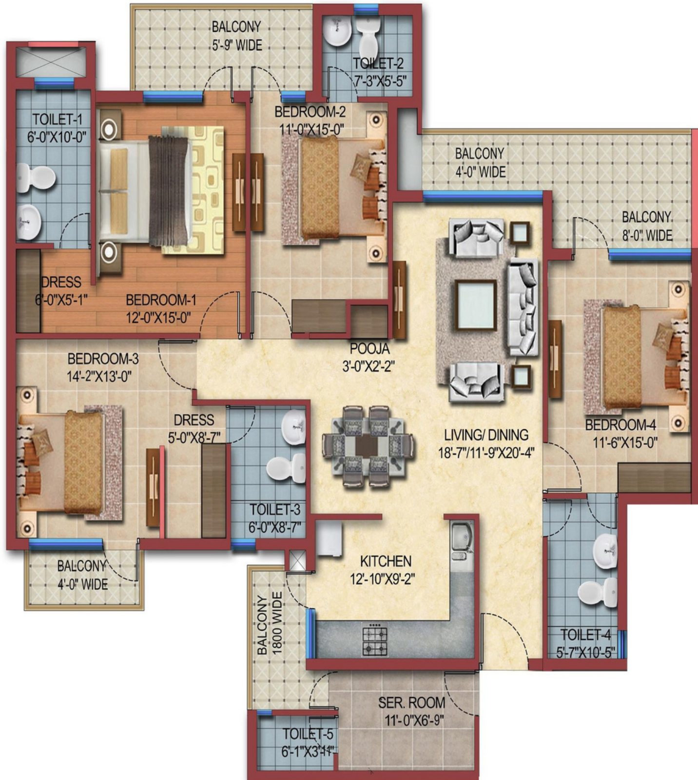
UNIT PLAN 2 & 3